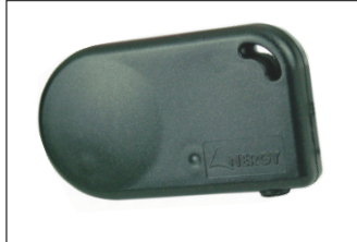
TEMPERATURE DATA LOGGER