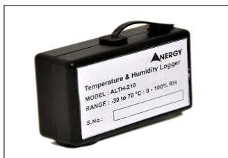
TEMPERATURE & RH DATA LOGGER