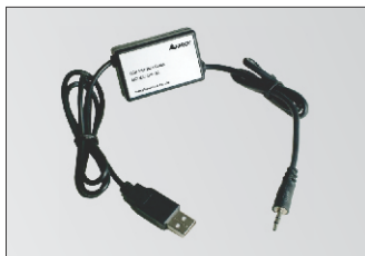
PC INTERFACE CABLE